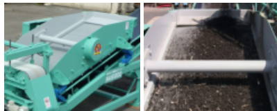
SCREEN Separation by size